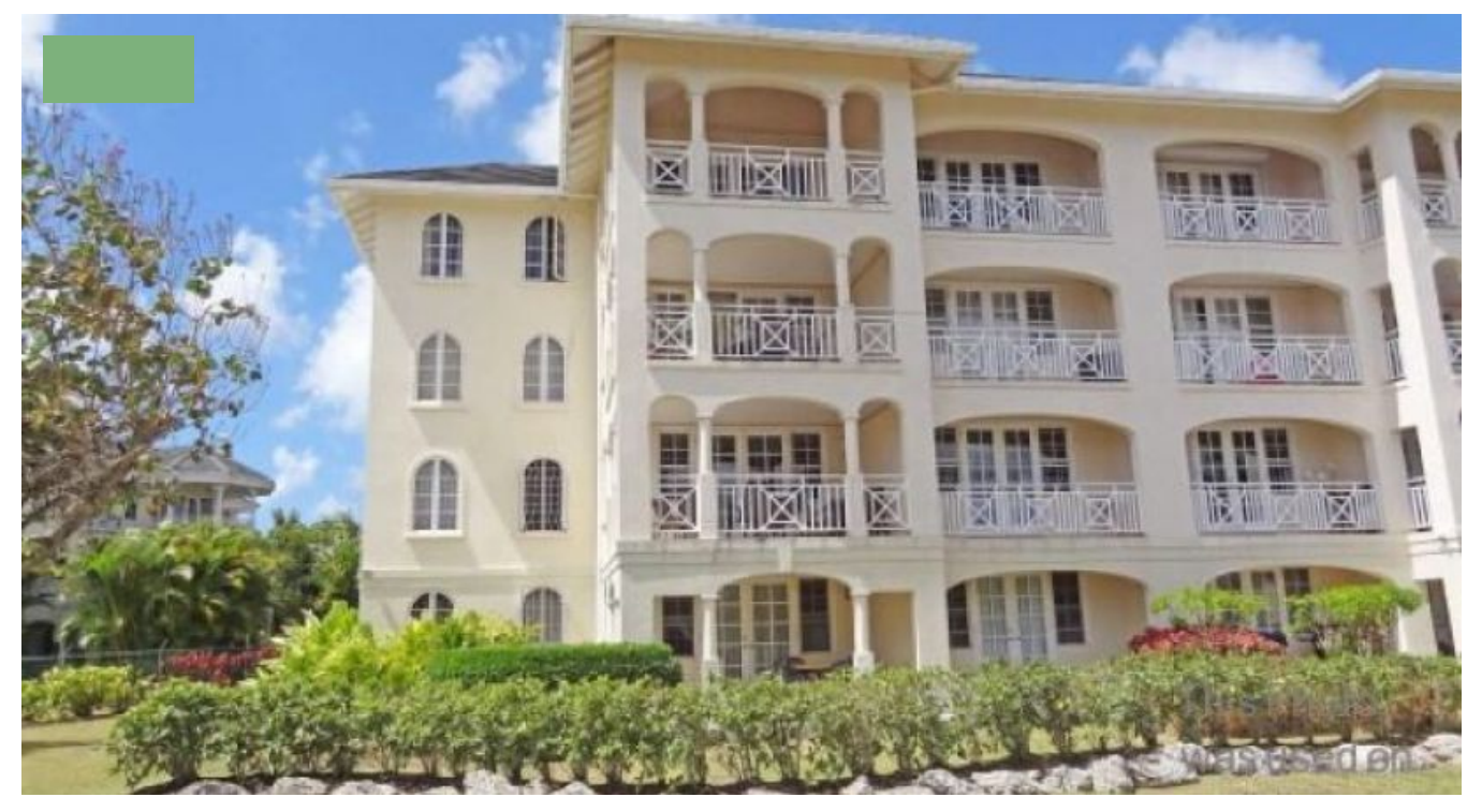
MILLENNIUM RIDGE, ST. THOMAS-/TOP FLOOR FLAT WITH VIEW

Special Features Pool Gated community Quiet Location Centrally Located Spacious About : Millennium Ridge- Top Floor with Amazing View,St. Thomas