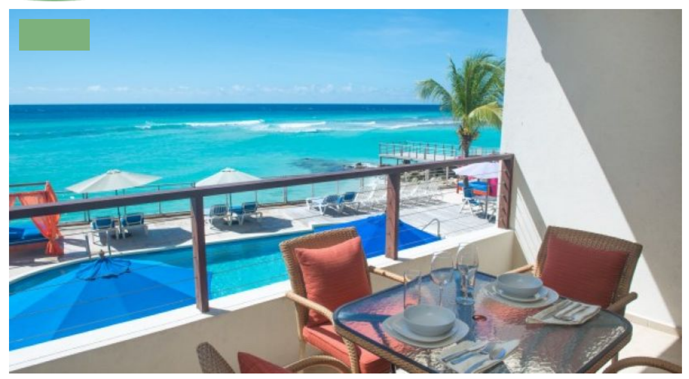
UNIT #2, ST. LAWRENCE BEACH CONDOS, ST. LAWRENCE GAP