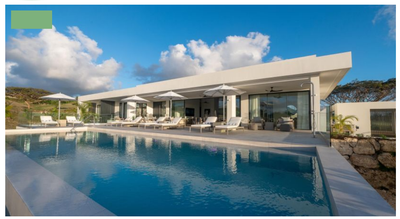
APES HILL - MOONSHINE RIDGE 13 - MOONDUST VILLA