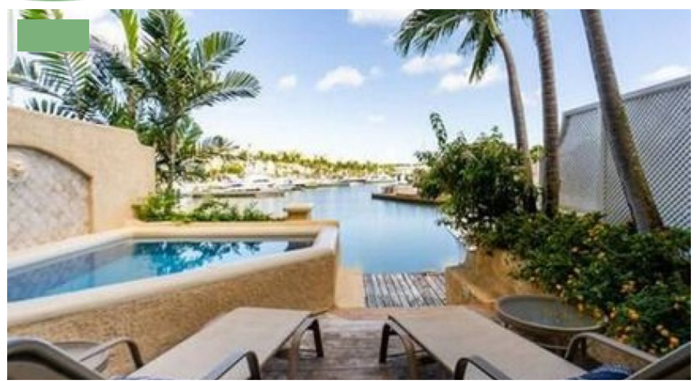
PORT ST. CHARLES - LAGOON FRONT VILLA #163