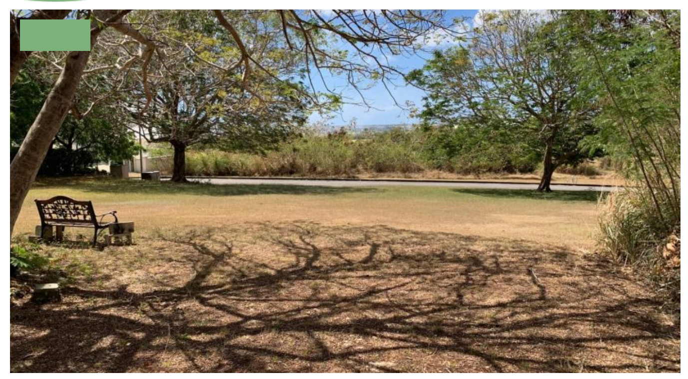
ROLLING HILLS, LOT 28, ST. GEORGE, BARBADOS