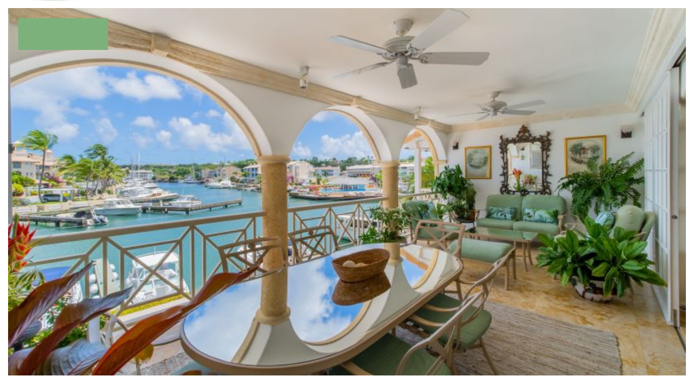
PORT ST. CHARLES UNIT #266, ST. PETER, BARBADOS