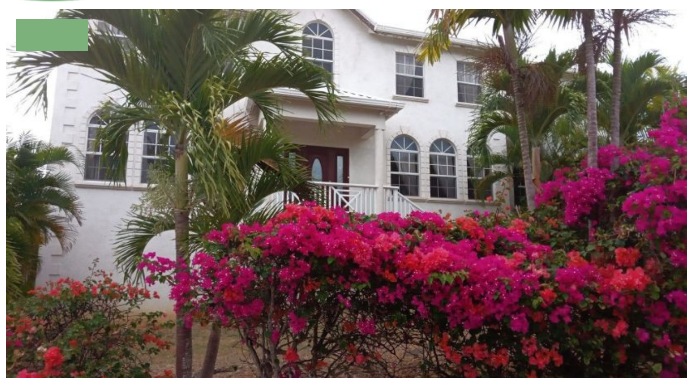
PLEASANT HALL "VILLA OF LIGHT", LOT 10 OCEAN VIEW - EXECUTIVE HOME