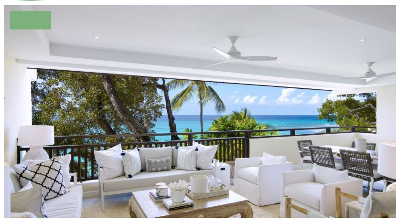
CORAL COVE, UNIT 9, 'BEACHI', PAYNES BAY, ST. JAMES, BARBADOS