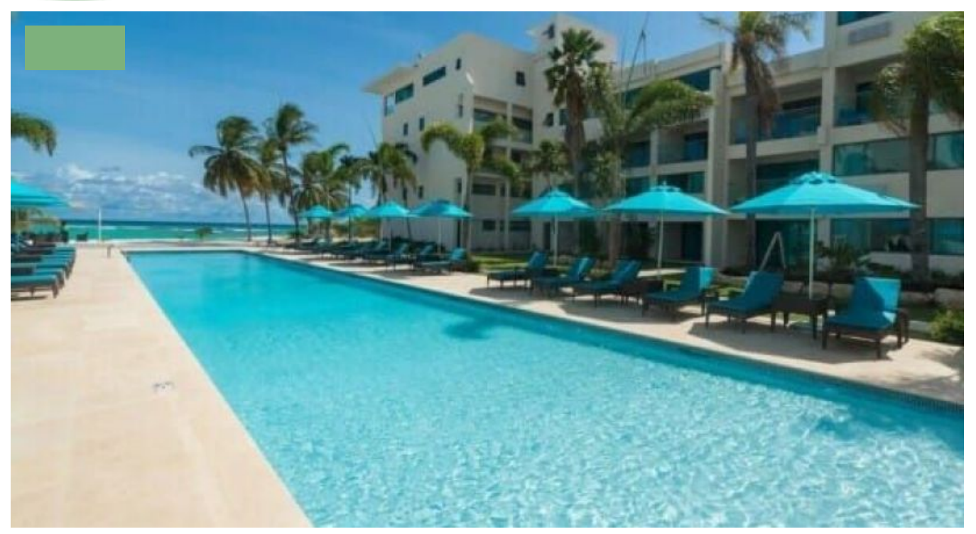
REDUCED – BEACHFRONT ONE BEDROOM GARDEN CONDO AT THE SANDS RESORT, UNIT 30