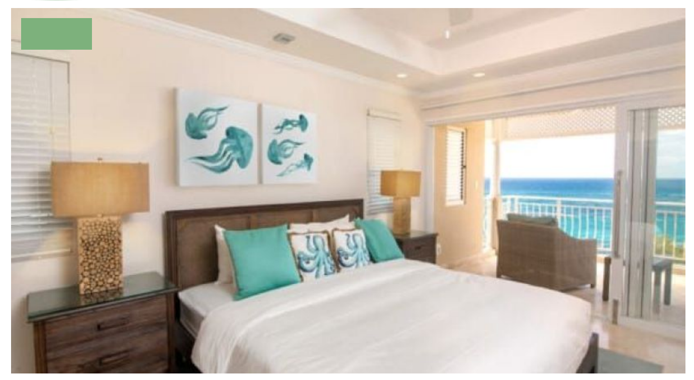
THE CRANE PRIVATE RESIDENCES, FULLY FURNISHED, OCEANVIEW-PHASE 3