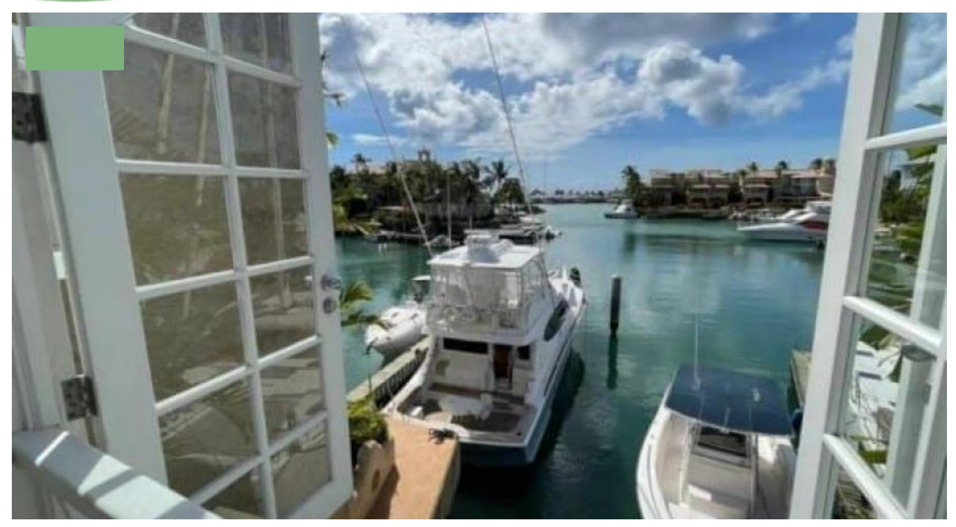
REDUCED – 3 BED LAGOON FRONT APARTMENT WITH 50FT YACHT BERTH – 211 PORT ST CHARLES, ST. PETER