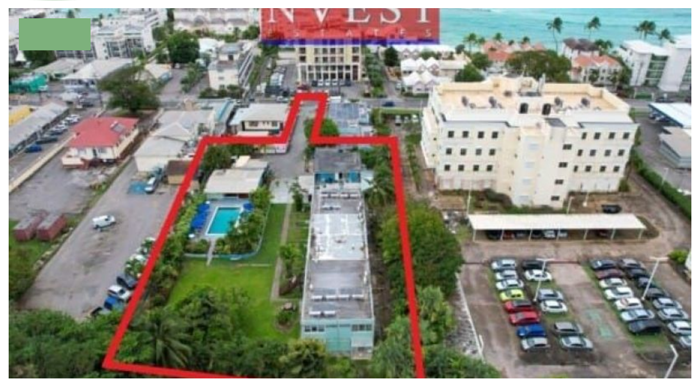
SALE PENDING – FULLY OPERATIONAL BOUTIQUE HOTEL, PALM GARDEN, BARBADOS, CARIBBEAN. EXCLUSIVE*