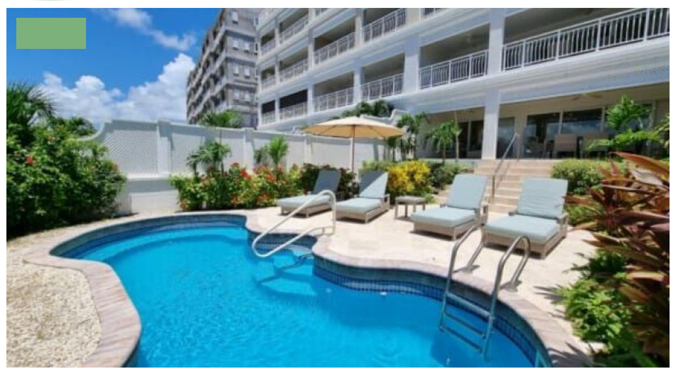
5212 2 BED, MOVE IN READY OCEAN VIEW CONDO WITH POOL, CRANE PRIVATE RESIDENCES (PHASE 2)