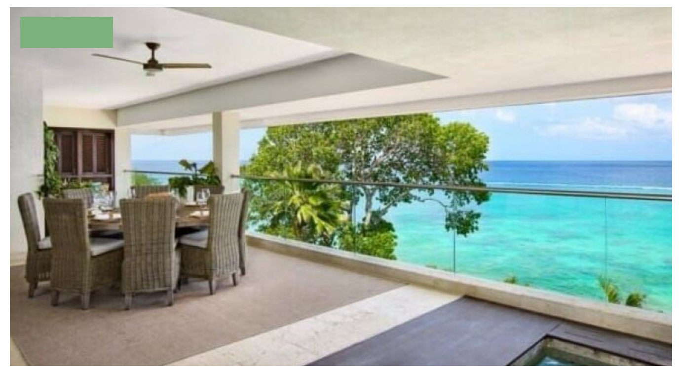
PORTICO 3 – LUXURY HOLIDAY RENTAL, BARBADOS