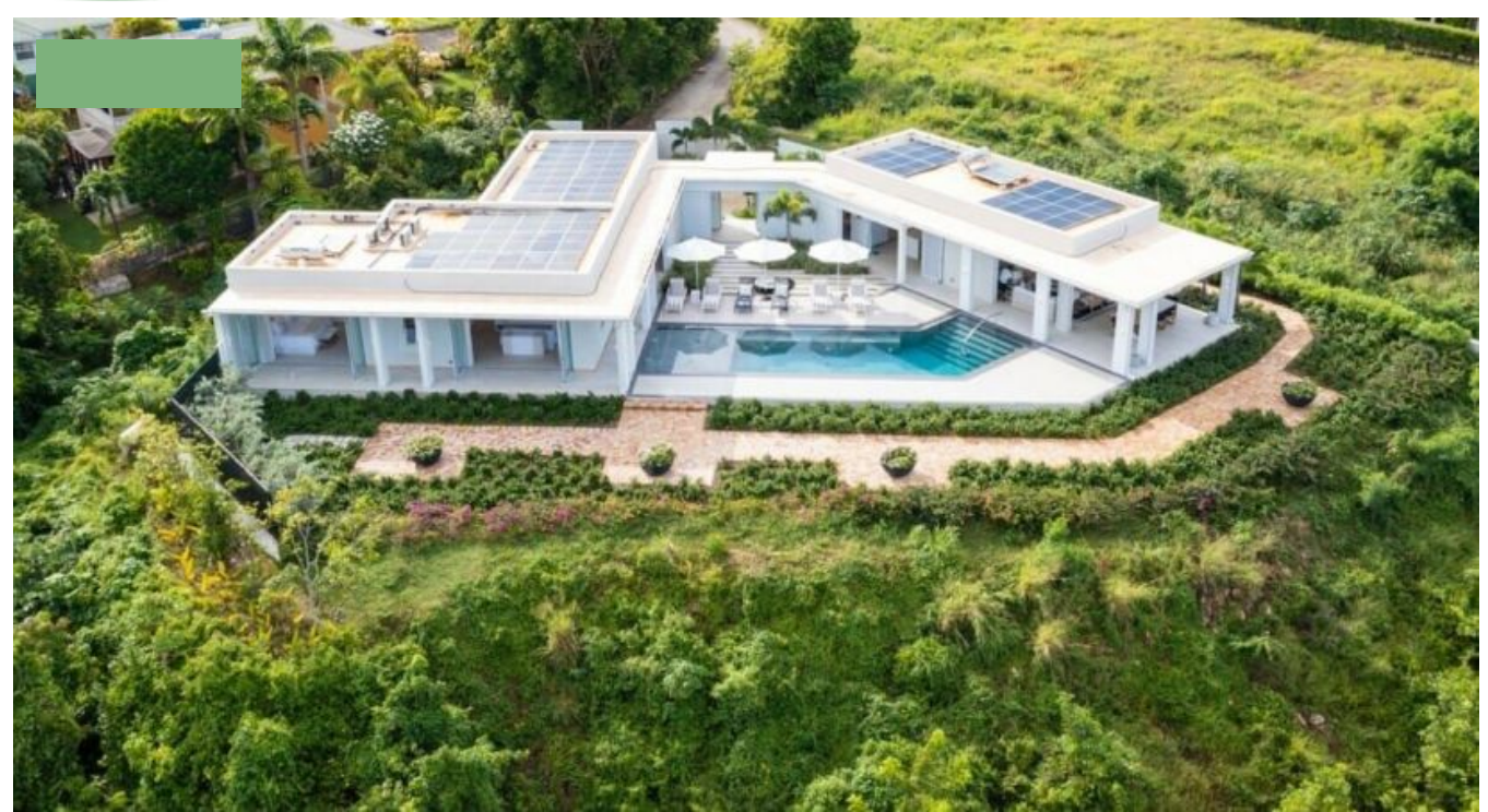
COOL BREEZE - LUXURY HOLIDAY RENTAL, BARBADOS