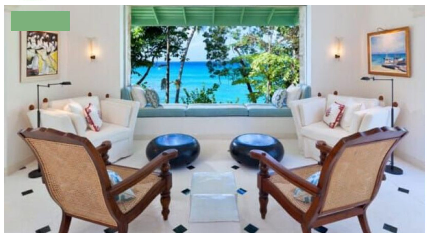
CRYSTAL SPRINGS - LUXURY HOLIDAY RENTAL, BARBADOS