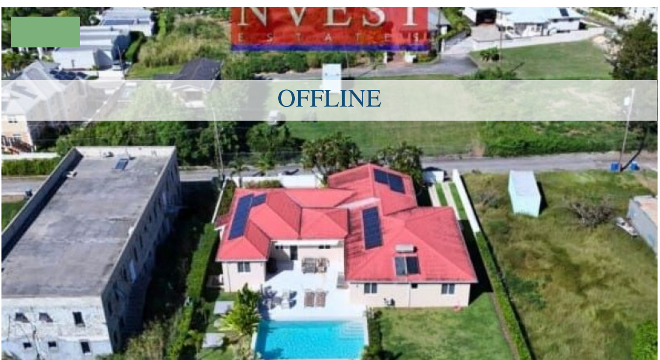
REDUCED – VILLA SPIAGGIA. STEPS FROM THE BEACH, MINUTES FROM HOLETOWN