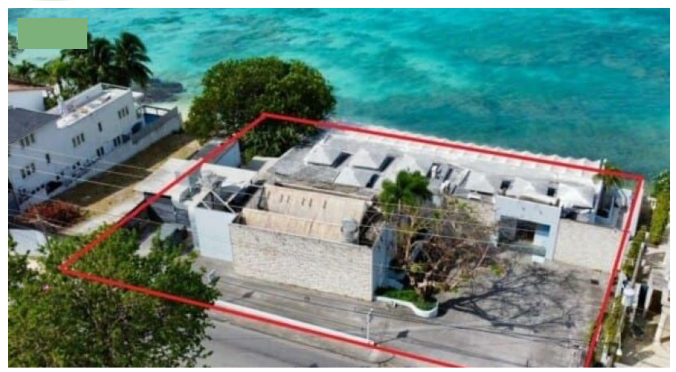
REDUCED- 'SIESTA', PRIME BEACHFRONT LOT IN PROSPECT, ST. JAMES