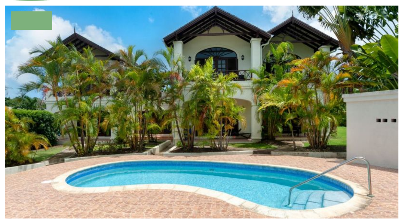
GIBBS, AURORA TOWNHOUSES, ST. PETER, BARBADOS