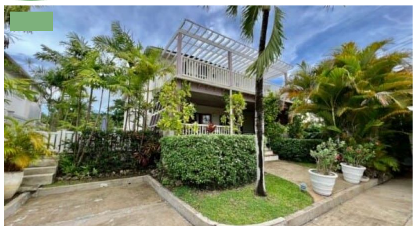
REDUCED - PAVILION GROVE NO. 6, ST. JAMES, BARBADOS