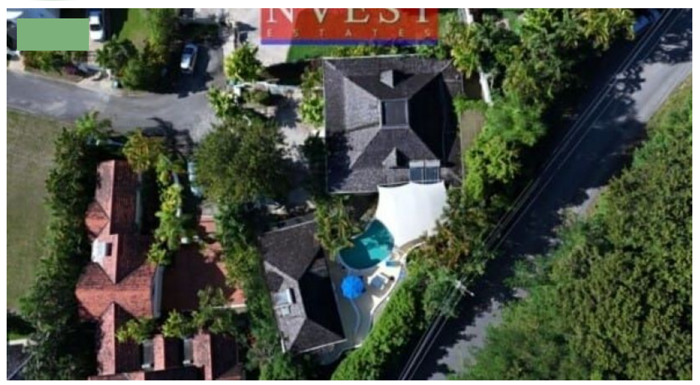
WEST COAST VILLA WITH POOL & 2 COTTAGES, ST JAMES - WESTPORT