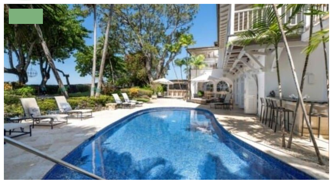
REDUCED - SAND DOLLAR, TURNKEY BEACHFRONT VILLA, ST. JAMES