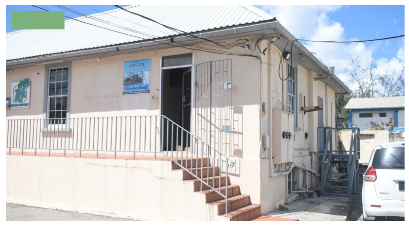
UNIT 4, "GLADSTONIA", FONTABELLE *