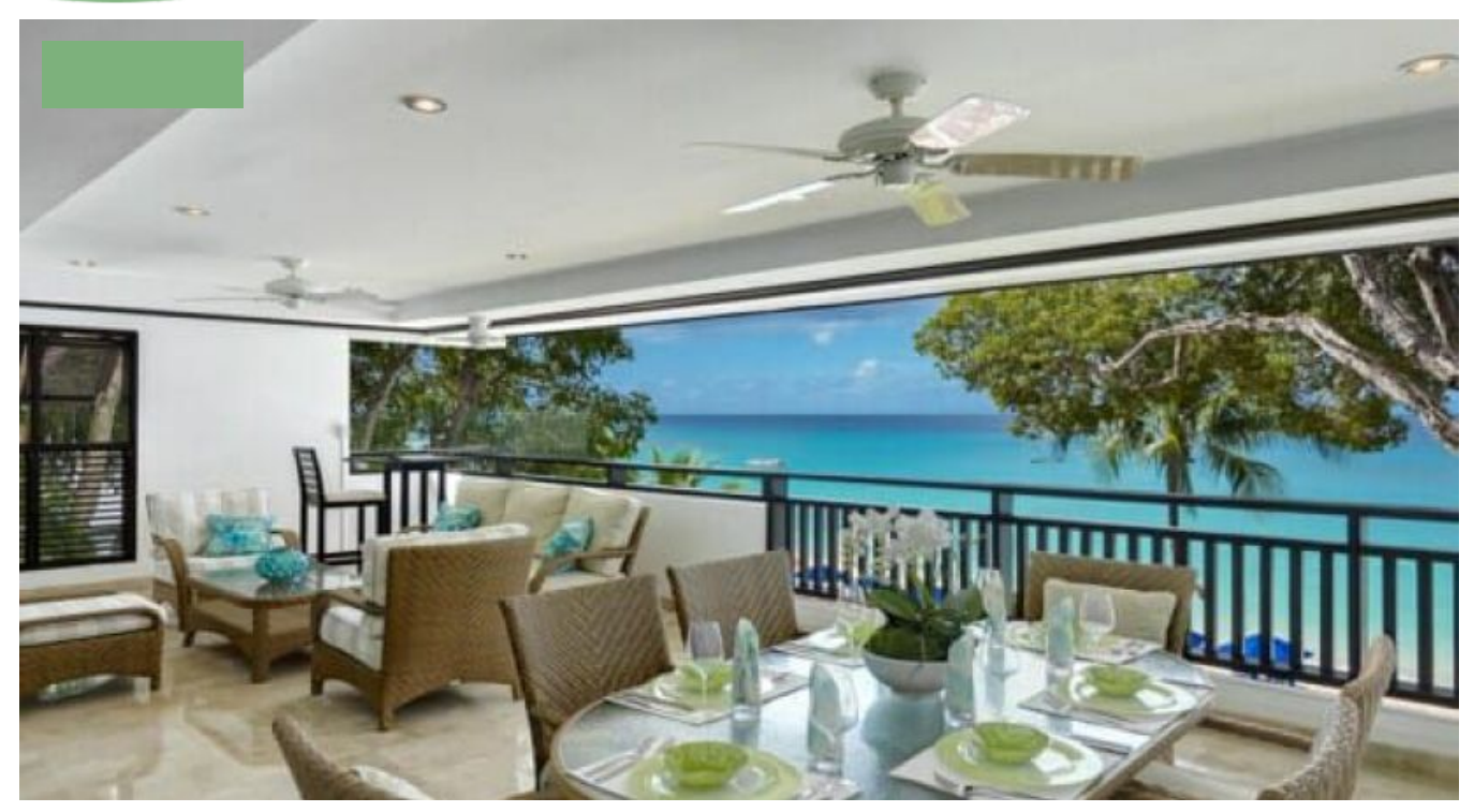
CORAL COVE 7 - SUNSET - LUXURY HOLIDAY RENTAL, BARBADOS