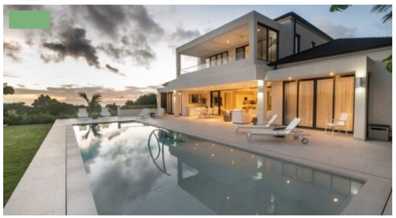
DAY DREAMER VILLA, FULLY FURNISHED + APES HILL GOLF RESORT MEMBERSHIP – MOVE IN READY