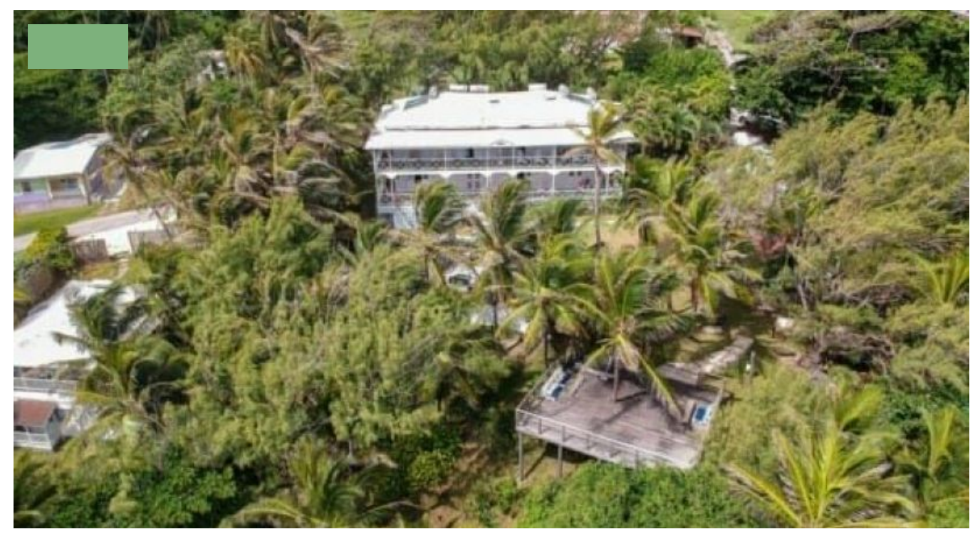
REDUCED - BOUTIQUE HOTEL & RESTAURANT ON THE EAST COAST