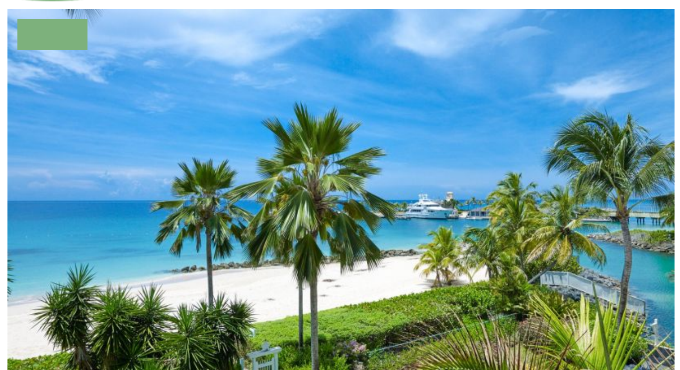
PORT ST. CHARLES, UNIT 380, BARBADOS