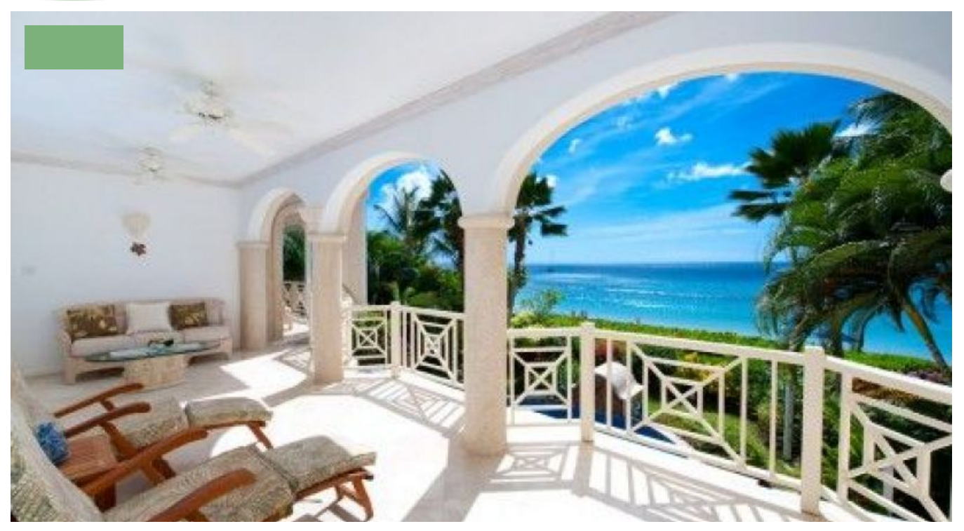
PORT ST. CHARLES 276 - 3 BEDROOM BEACH FRONT APARTMENT