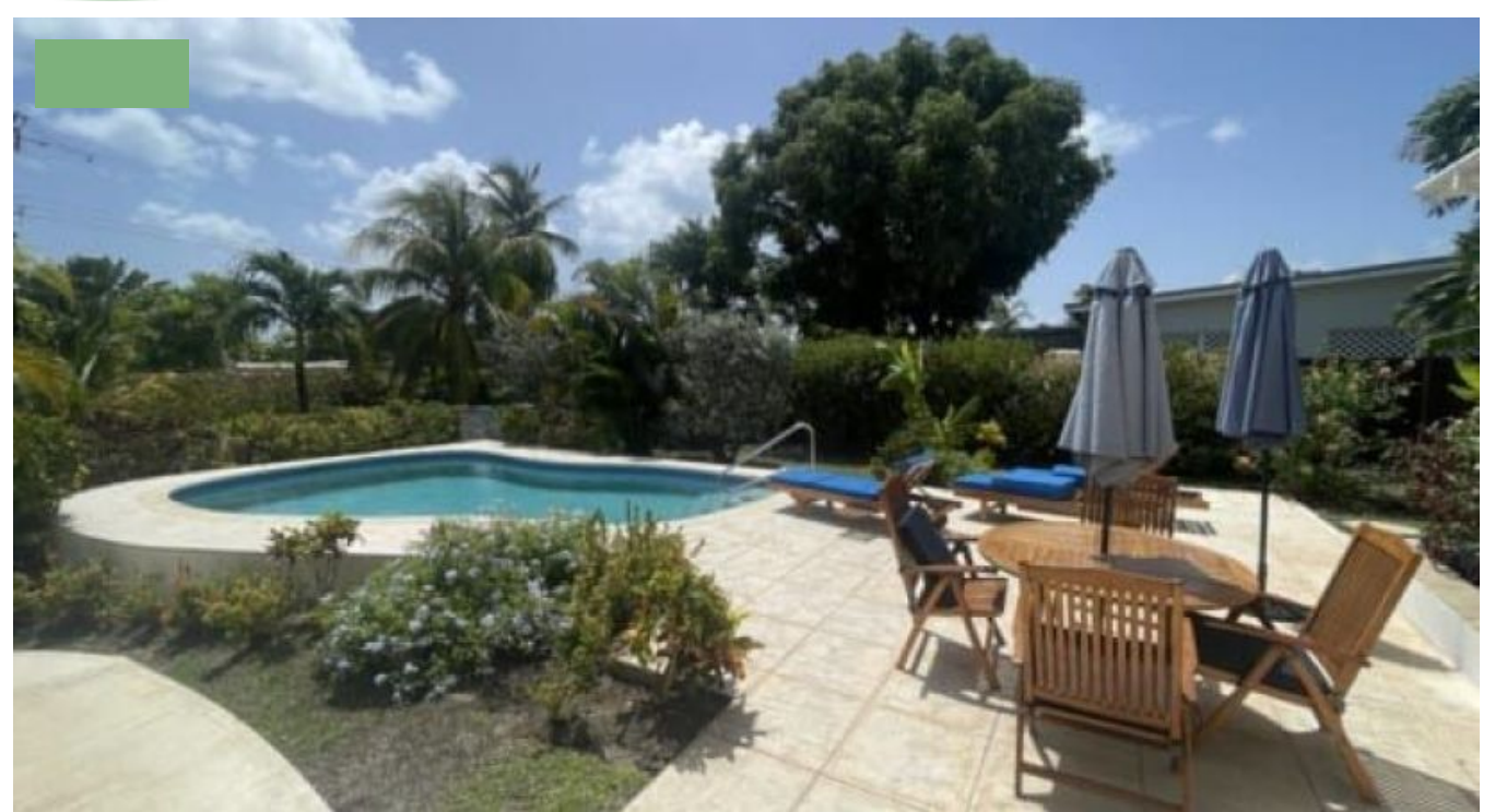
SALE PENDING – 2 BED HOME WITH PRIVATE POOL – MAYHOE AVENUE #132, SUNSET CREST, ST. JAMES