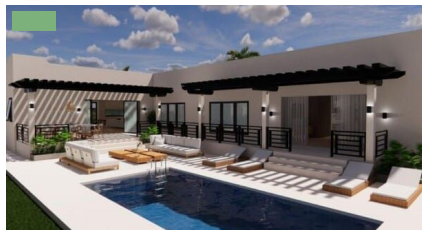
REDUCED – BRAND NEW 4-BEDROOM VILLAS NEAR BARBADOS GOLF CLUB – DURANTS FAIRWAY VILLAS, CHRIST CHURCH

Located on the south coast of Barbados in a quiet cul-de-sac, just steps from The Barbados Golf Club lies