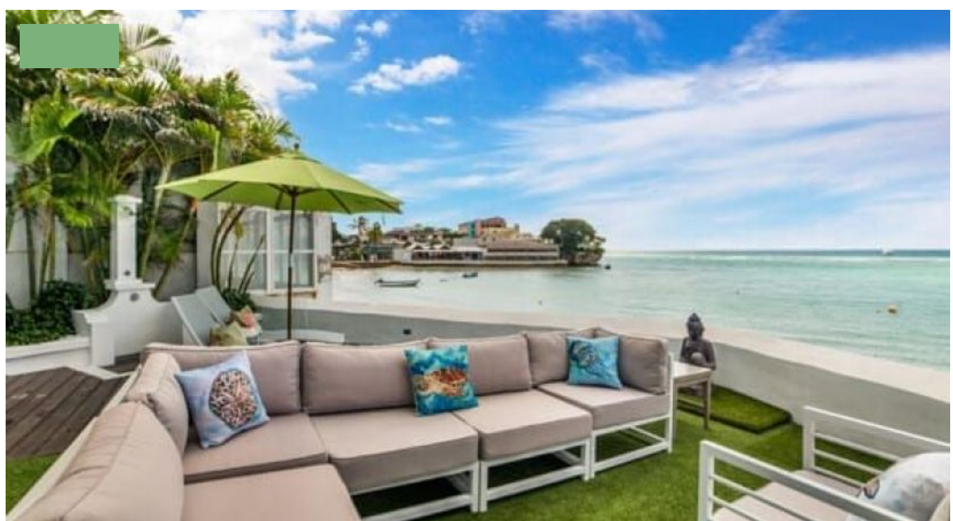
REDUCED - LUXURIOUS WATERFRONT VILLA IN ST. LAWRENCE GAP -WORTHING, SUNKISS VILLA