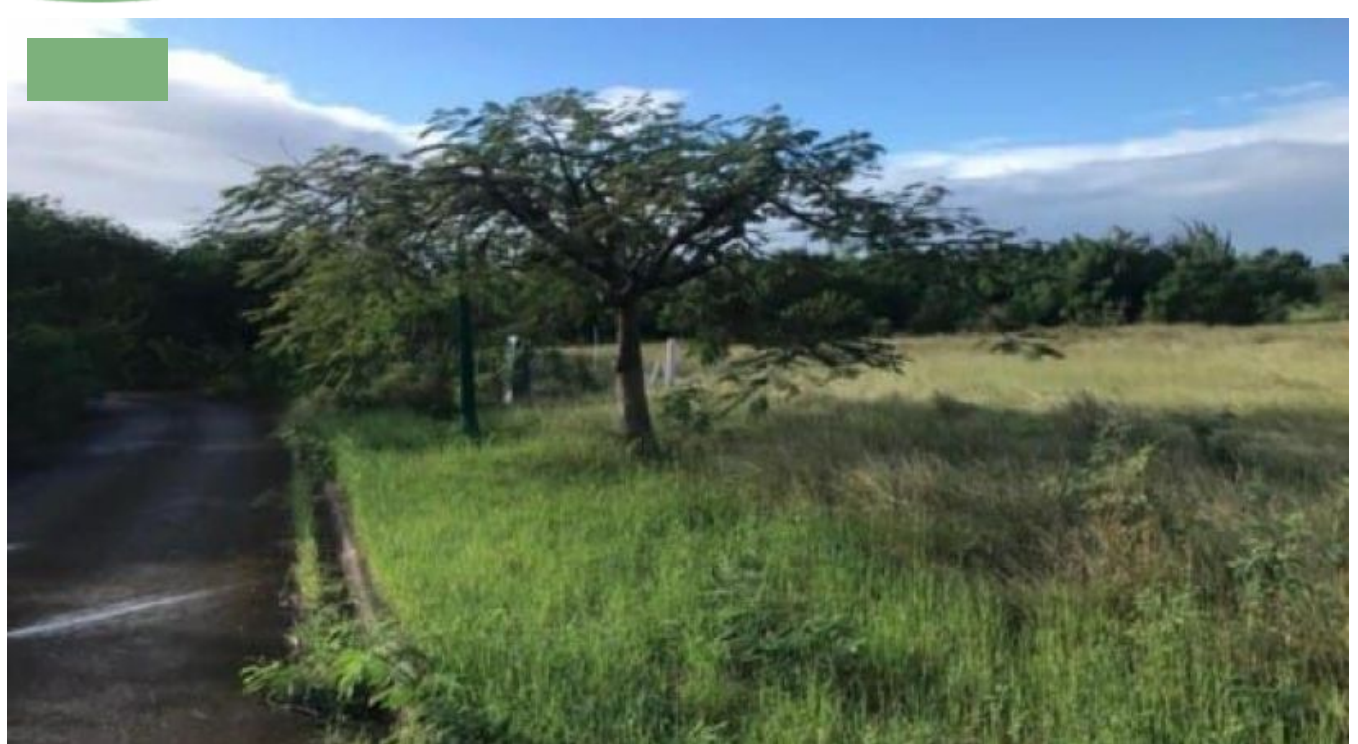
SALE PENDING – HERON MILL ESTATE LOT 5 & 6, MULLINS, ST. PETER, BARBADOS