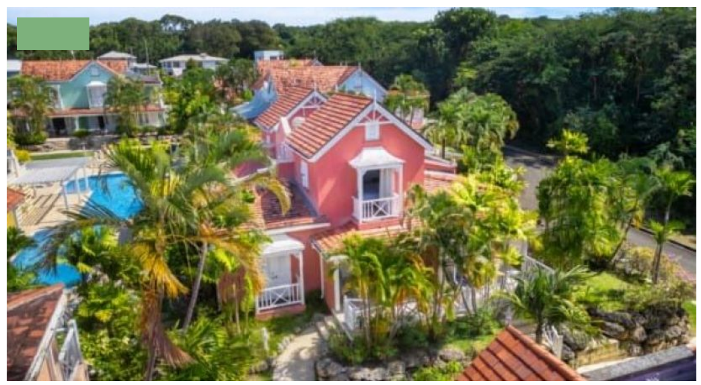
SALE PENDING – 2 BED TOWNHOUSE NEAR MULLINS BEACH – KINGS BEACH VILLAGE, UNIT 11, ROAD VIEW