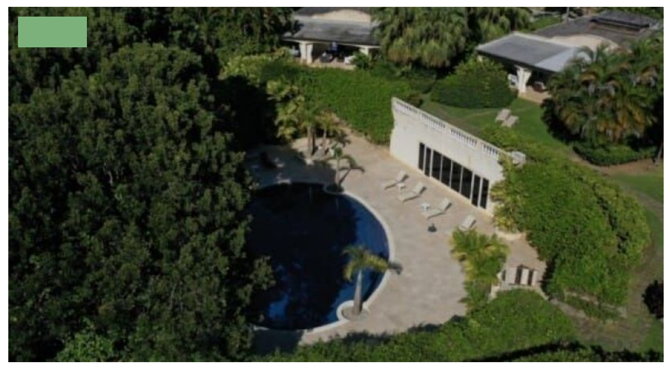
LUXURY 4 BED VILLA WITH GUEST COTTAGE AND LUSH GARDENS – GREENTAILS NO. 5, SION HILL, ST. JAMES