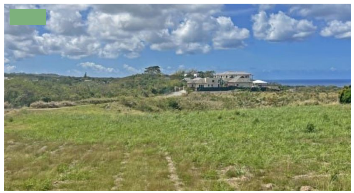
SALE PENDING - 1.10 ACRE LOT - LANCASTER LOT 1C (A), ST. JAMES